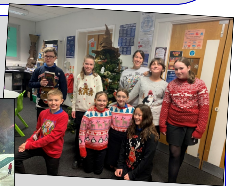
Christmas jumper day at Northgate.